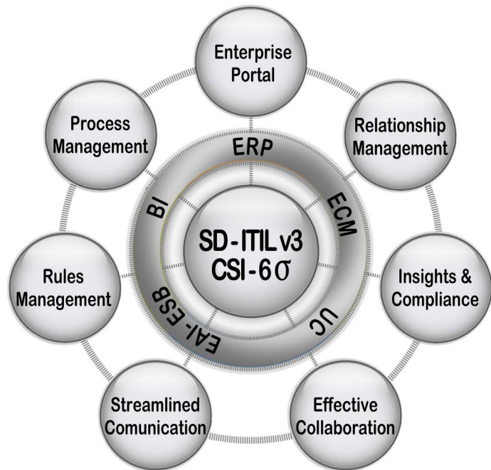
Comprehensive solutions eco-system

Established on the principle of quality and business driven service delivery, Group Three is the region's leading system integrator and service provider. Delivering solutions in Business Management System (ERP), Business Intelligence & Reporting, Unified Communications, Business Process Management, Customer Relationship Management, Enterprise Content Management and Enterprise Portal, providing a comprehensive solutions eco system for SMEs.